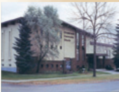
Crossroads Community Church, 2002