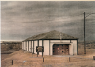
St. Clement Church