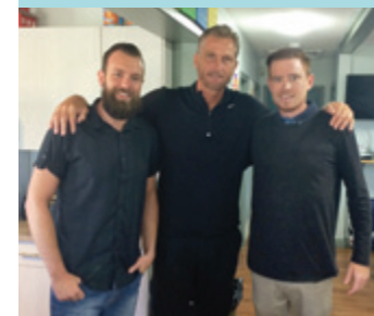
Community supporters are the backbone of Cornerstone