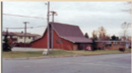
Ascension Lutheran Church, 2002

Our first church in Belfast was the church in this photo built around 1915. It also housed the Belfast School until 1920 until they moved the Nose Creek School next to it. It was located 10th Ave and 17th A. St. NE and served the community till 1959. It was a Presbyterian church from 1915 to 1926 and then became a United Church from 1926 to its closure in 1959.