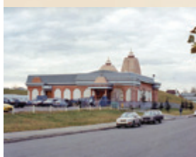
Hindu Temple, 2002

The current church is quite a prominent landmark of the community today as it overlooks both Deerfoot Trail and 16th Avenue. Thanks to Peirra for help in locating photographs.