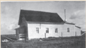
Belfast Presbyterian Church

Our first church in Belfast was the church in this photo built around 1915. It also housed the Belfast School until 1920 until they moved the Nose Creek School next to it. It was located 10th Ave and 17th A. St. NE and served the community till 1959. It was a Presbyterian church from 1915 to 1926 and then became a United Church from 1926 to its closure in 1959.