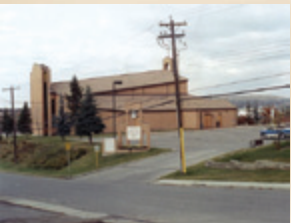
Our Lady of Grace Church, 2002