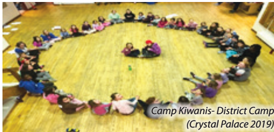
Camp Kiwanis- District Camp (Crystal Palace 2019)

If you haven't seen us for cookies and would like to purchase some or have questions, comments and/or concerns, please feel free to contact Meribeth Barclay at 403-874-7297 or crystalpalacedistrict@gmail.com