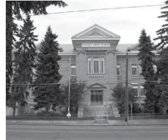
950-6 Street, N.E. City-Wide Historic Resource

This month we highlight Stanley Jones Elementary School