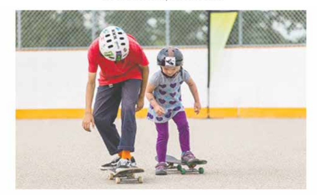
Program Time: Monday—Friday from 11 a.m.—7p.m. Saturday—Sunday from 10 a.m.—6 p.m. For more information call 3-1-1 or visit www.calgary.ca/skateparks

All participants must have a signed waiver, if under 18, the participant will need it signed by a parent / guardian before being able to participate in this program. Waivers are available on-site and on www.calgary.ca/skateparks. Helmets are mandatory when using the park. You are welcome to bring your skateboard, rollerblades, or scooters to the park. Rental skateboards and helmets are free to use on a first come, first serve basis.