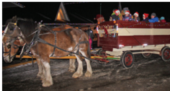
~see photo collage on page 12~