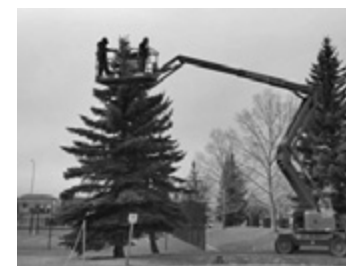
~continued on page 14~

We hope that you enjoyed the Arbour Lake Residents Association light display this holiday season! Did you know that all of the lights and displays are put up by our lake staff? They spend countless hours testing and hanging over an estimated 500,000 lights. We start this process in October to ensure that all of the lights are ready for the "Big Reveal" at light the night. Special thanks to our staff for braving the cold, snow, and wind outside and up on the lift!