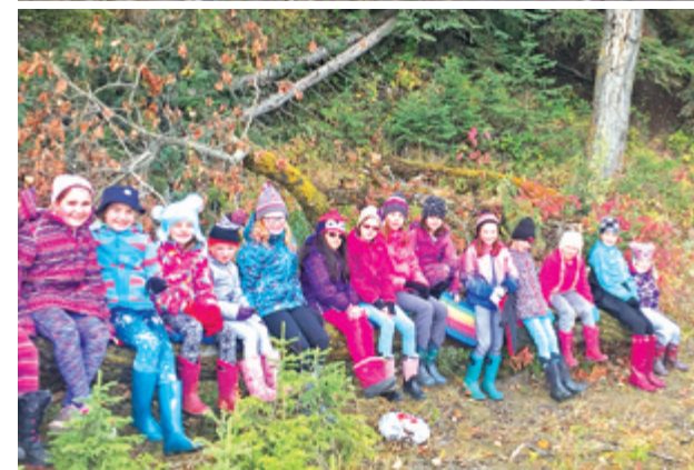
Guides in Wichewakn District, Calgary, Canada, and beyond!