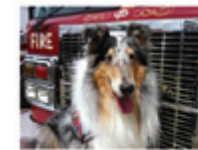
Fire Safety Tips with Flint https://youtu.be/CbE3ICBzeY0

Please watch and share our new fire safety video with your family: