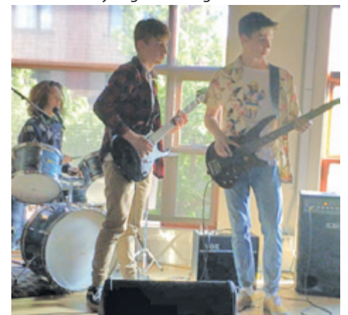
Wet Paint, one of our local bands, warming up for a great performance