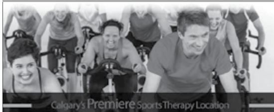
Calgary's Premier Sports Therapy Location

Monday to Friday 7 am - 7 pm • Saturday 8:30 am - 12 pm