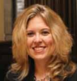
Calgary Nose Hill Hon. Michelle Rempel, MP 201-1318 Centre Street NE, Calgary, AB, T2E 2R7 Phone: 403-216-7777 Email: michelle.rempel@parl.gc.ca Website at www.michellerempel.ca

As you know, my top priority remains the Alberta economy and jobs crisis here at home. I will continue to work hard on your behalf and demand that this government provide the relief and job creating policies that Albertans need in order to get back to work. That's why my colleagues and I created the Alberta Jobs Taskforce, in order to listen to Alberta employers and those who are out of work and convey their solutions directly to the federal government. The report, along with the 11 recommendations, is on my website at www.MichelleRempel.ca .