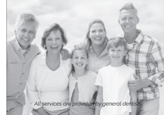
All services are provided by general dentists

#4, 5602 – 4 St NW Next to Shoppers Drug Mart www.thorncliffefamilydental.com