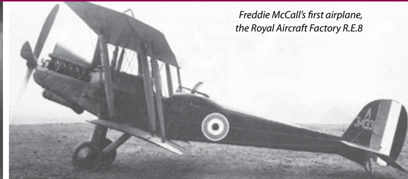
Freddie McCall's first airplane, the Royal Aircraft Factory R.E.8