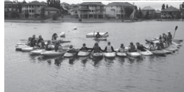
Organized chaos (learning how to paddle for the very first time ever)