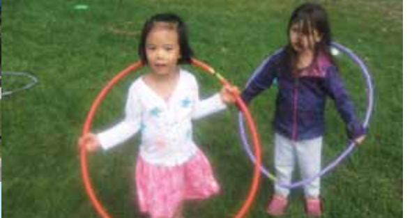
North Haven Preschool – Spaces Available NHCA Website – northhavenyyc.ca

Great News Publishing Ltd. 403.720.0762 | 403.263.3044 sales@great-news.ca | www.great-news.ca