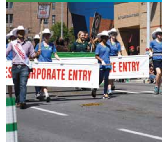
Pathfinders walking in the 2015 Stampede Parade

The North Haven Girl Guides wish everyone a great summer. Happy Stampeding!