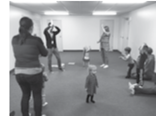
Our September Library Visit