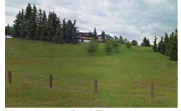
North Haven Real Estate Update Last 12 Months North Haven MLS Real Estate Sale Price Update

Any North Haven Member that would like to submit an announcement please contact northhavennewsletter@gmail.com. Examples could include notes to say thank you or offer sympathy, acknowledge birthdays or wedding anniversaries.