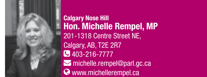
Calgary Nose Hill Hon. Michelle Rempel, MP 201-1318 Centre Street NE, Calgary, AB, T2E 2R7 403-216-7777 michelle.rempel@parl.gc.ca www.michellerempel.ca

THE GUTTER DOCTOR! We install, fix and clean eaves-troughs and downspouts. We also install and fix fascia, soffit, drip-edge, siding, roofing, cladding. Over 20,000 happy customers since 2003! Insured and guaranteed work with references. We take pride in doing a good job. A+ rated BBB Member. 2017 Consumer's Choice Award Winner. www.gutterdoctor.ca 403-714-0711.