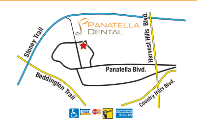
Located Beside Save-On-Foods In Panorama Hills

650, 1110 Panatella Blvd., NW, Calgary, AB T3K 0S6