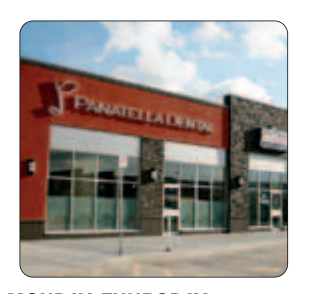
MONDAY-THURSDAY 7am - 8pm FRIDAY & SATURDAY 8am - 4pm