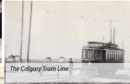
The Calgary Tram Line