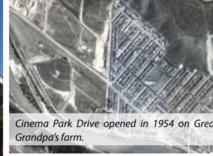
Cinema Park Drive opened in 1954 on Grandpa's farm.