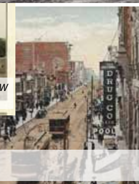
Calgary 8th Ave 1912

paid the utmost respect to the heritage of the house and kept much of the character. The house continues to have a great presence and peaceful atmosphere that radiates warmth and happiness.