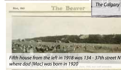
Fifth house from the left in 1918 was 134 - 37th street NW where dad (Mac) was born in 1920