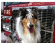
Fire Safety Tips with Flint https://youtu.be/QbE3ICBzeY0

Please watch and share our new fire safety video with your family: