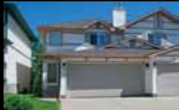
34, 10 TUSCANY VALLEY VIEW NW