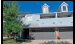
82 VALLEY RIDGE HTS NW