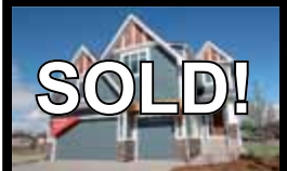
303 TUSLEWOOD TERRACE NW