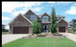
23 WATERMARK ROAD