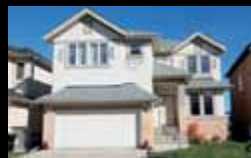
103 TUSCANY ESTATES CL NW