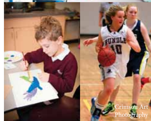
Crimson Art Photography