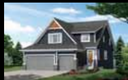
343 TUSLEWOOD TERRACE NW