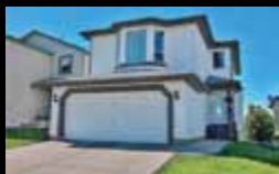
170 TUSCARORA CLOSE NW