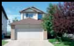
86 TUSCANY RAVINE CLOSE NW