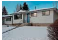
4728 Mardale Road 5 Beds | 2 Baths | $399,900 C4044000