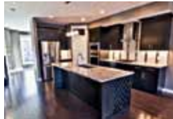
454 29 Avenue NW 4 Beds | 3.5 Baths | $709,900 C4052566