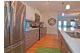
1914 13 Street SW 2 Beds | 2.5 Baths | $609,900 C4045795