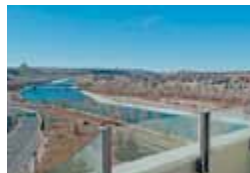
#1110, 1108 6 Avenue SW 2 Beds | 2 Baths | $574,900 C4051038