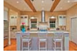
511 7A Street NE 4 Beds | 3.5 Baths | $1,144,000 C4050441