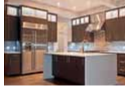
811 20A Avenue NE 5 Beds | 3.5 Baths | $1,149,900 C4039717