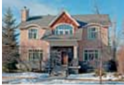
3029 2 Street SW 4 Beds | 2.5 Baths | $1,998,000 C4049882