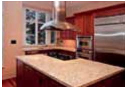
#101, 690 Princeton Way 2 Beds | 2 Baths | $912,000 C4042562