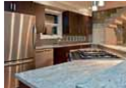
135 10 Avenue NW 4 Beds | 2.5 Bath | $649,900 C4051198