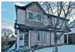
615 10 Avenue NE 3 Beds | 3.5 Baths | $589,900 C4045342