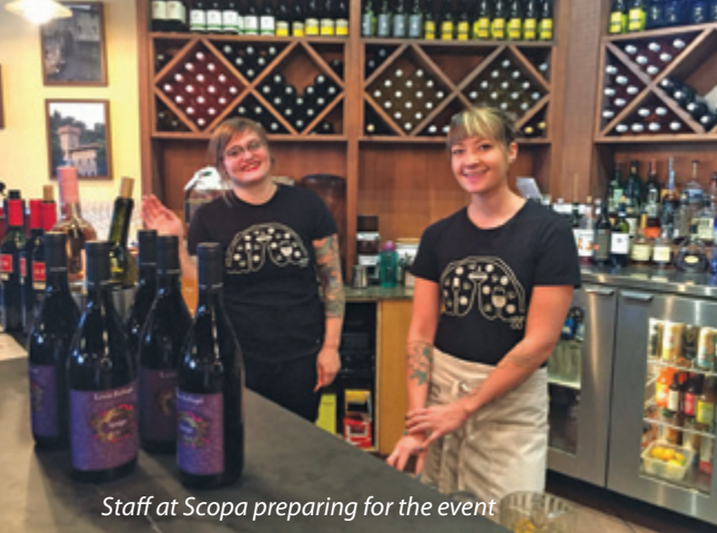
Staff at Scopa preparing for the event