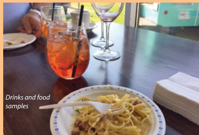
Drinks and food samples