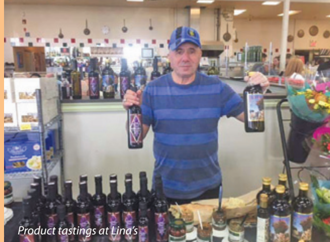
Product tastings at Lina's