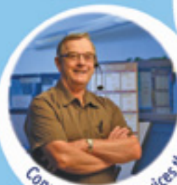
Connecting with services through 311