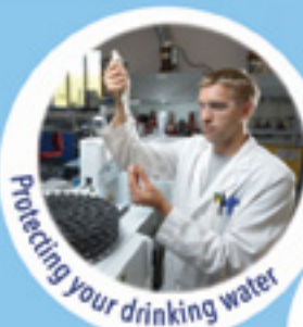
Protecting your drinking water