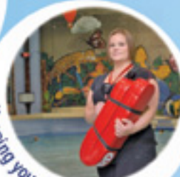
Keeping you safe at play