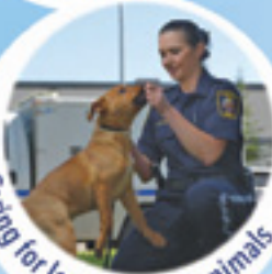
Caring for lost & abused animals