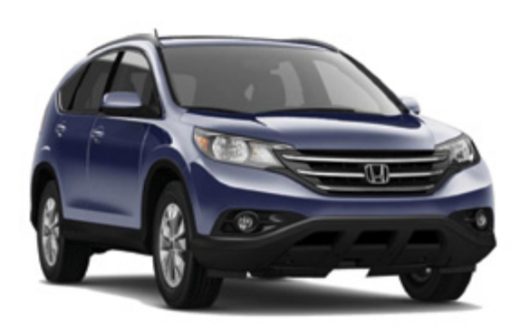
10% OFF REMOTE STARTER INSTALL PLEASE CALL FOR DETAILS