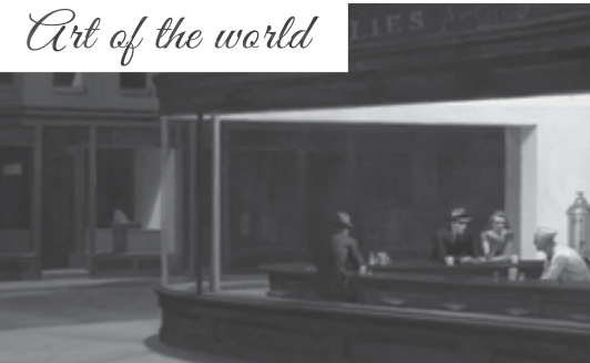
Edward Hopper was a prominent American realist painter and printmaker.

There really aren’t any shortcuts to reaching your desired financial destination. But by taking the slow and steady path, you can work toward getting there.