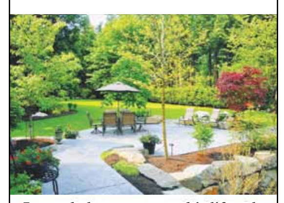
Let us help you create this lifestyle