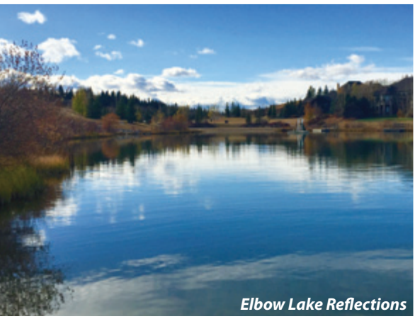
Elbow Lake Reflections