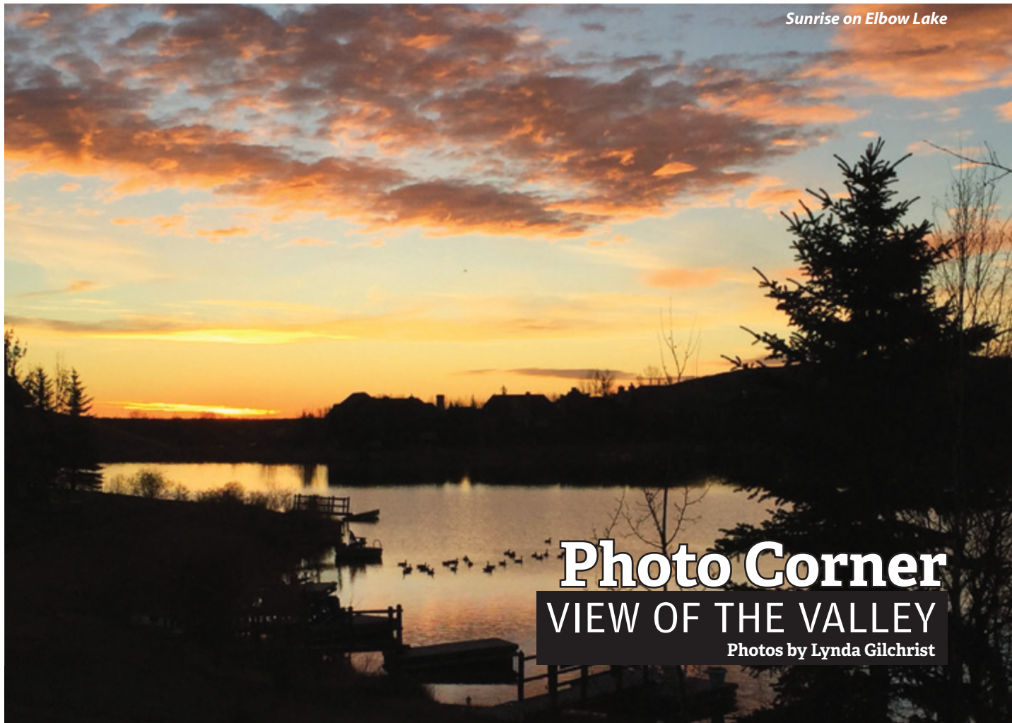
Sunrise on Elbow Lake