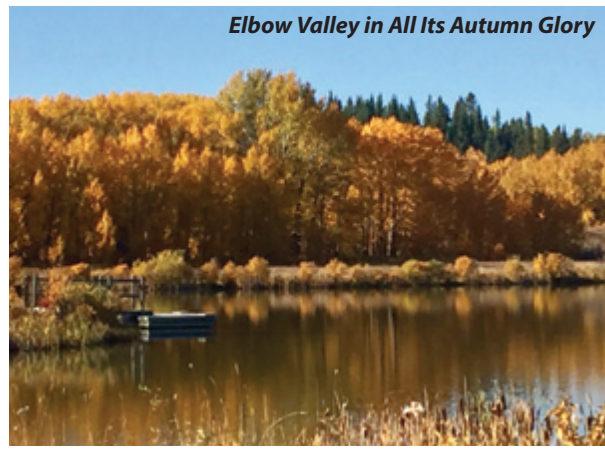
Elbow Valley in All Its Autumn Glory