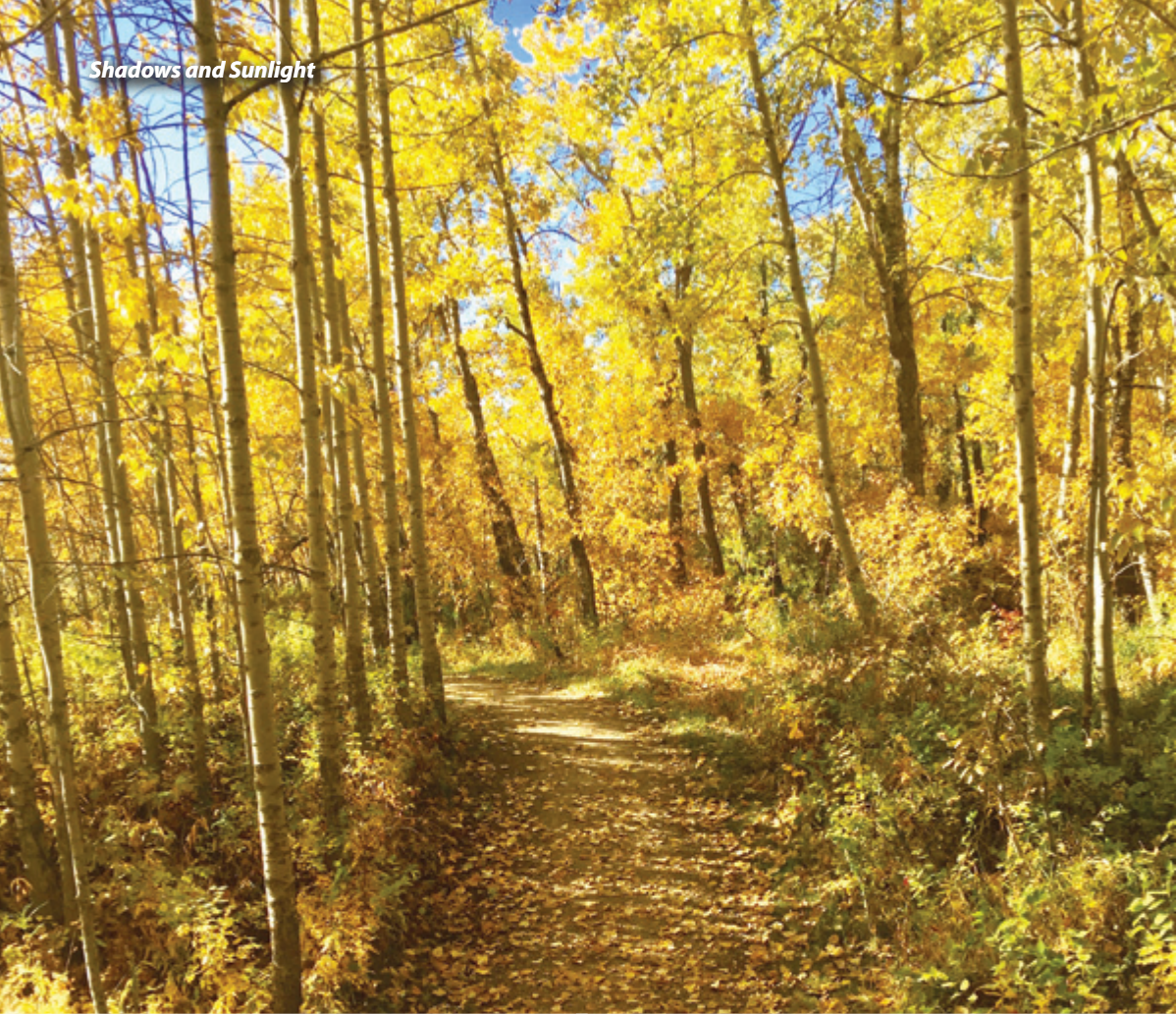
Shadows and Sunlight