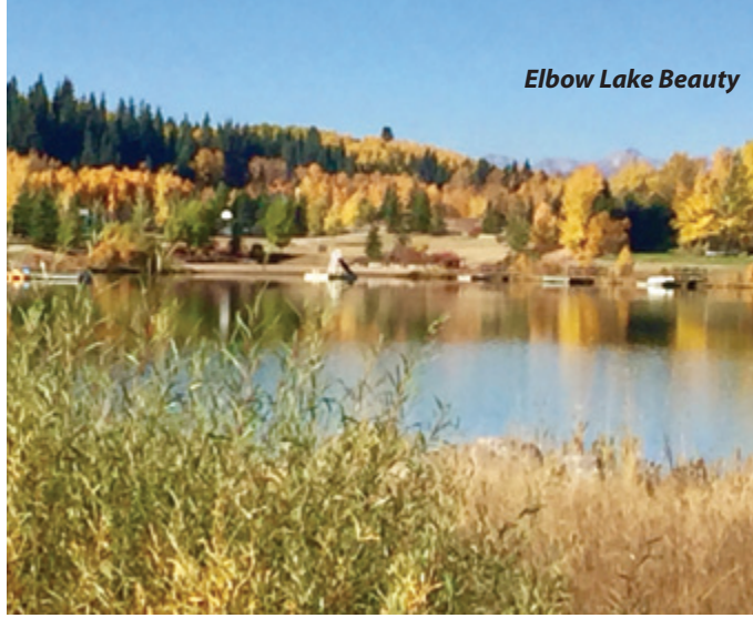
Elbow Lake Beauty