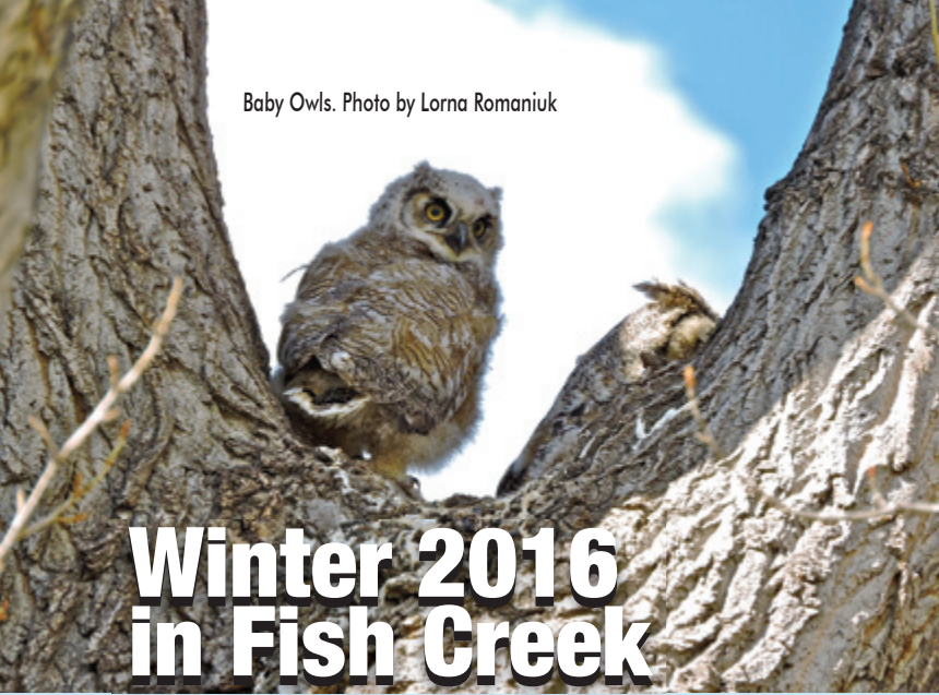
Baby Owls.