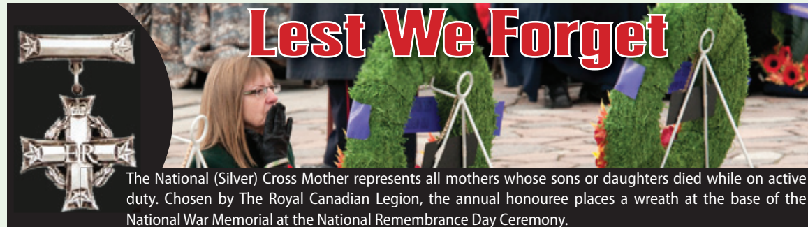
The National (Silver) Cross Mother represents all mothers whose sons or daughters died while on active duty. Chosen by The Royal Canadian Legion, the annual honouree places a wreath at the base of the National War Memorial at the National Remembrance Day Ceremony.

If you find an injured or orphaned wild bird or animal in distress, please contact the Calgary Wildlife Rehabilitation Society hotline at 403-239-2488 for tips, instructions and advice, or visit our website at www.calgarywildlife.org for more information.