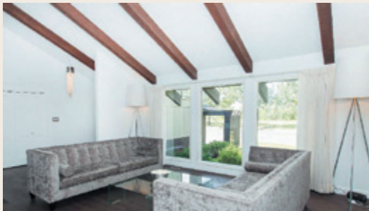
13820 Park Estates Drive