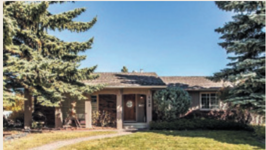
428 Parkridge Crescent