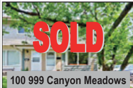
100 999 Canyon Meadows