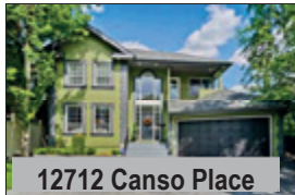
12712 Canso Place