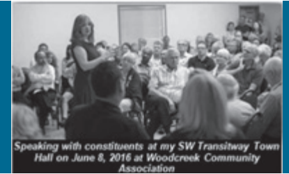
Speaking with constituents at my SW Transitway Town Hall on June 8, 2016 at Woodcreek Community Association