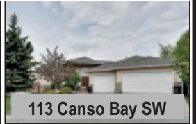
113 Canso Bay SW