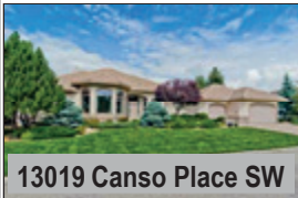
13019 Canso Place SW

CALL US TODAY FOR A FREE HOME MARKET EVALUATION