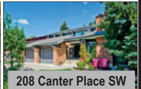
208 Canter Place SW