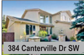
384 Canterville Dr SW