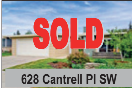
628 Cantrell Pl SW