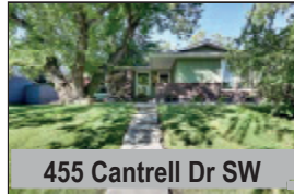
455 Cantrell Dr SW