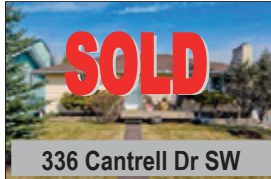
336 Cantrell Dr SW