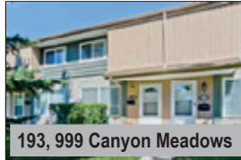
193, 999 Canyon Meadows