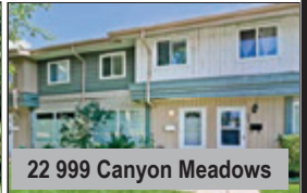
22 999 Canyon Meadows