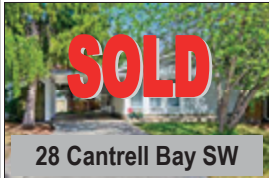
28 Cantrell Bay SW