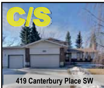
419 Canterbury Place SW