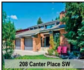
208 Canter Place SW