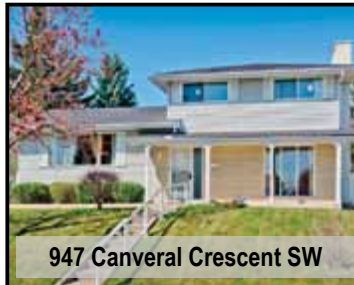
947 Canveral Crescent SW

CALL US TODAY FOR A FREE HOME MARKET EVALUATION