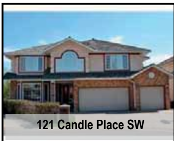
121 Candle Place SW