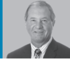
MP Calgary Signal Hill Ron Liepert

#2216, 8561 8A Avenue SW, Calgary, Alberta T3H 0V5 403-292-6666 403-292-6670 ron.liepert.C1A@parl.gc.ca