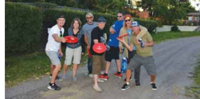
The Frisbee Golf Gang gets out for a round around the Glendale Community Hall.

community would need to come at the annual general meeting, or a special meeting where all community members in good standing would be given an opportunity to share their opinion.