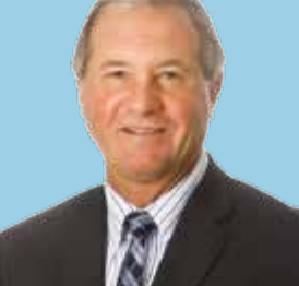
MP Calgary Signal Hill Ron Liepert #2216, 8561 8A Avenue SW Calgary, Alberta T3H 0V5 Phone: 403-292-6666 Fax: 403-292-6670 Email: ron.liepert.C1A@parl.gc.ca