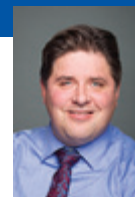
MP CALGARY CENTRE HON. KENT HEHR

Become a member today! Visit killarneyglengarry.com or fill out the form in this newsletter.