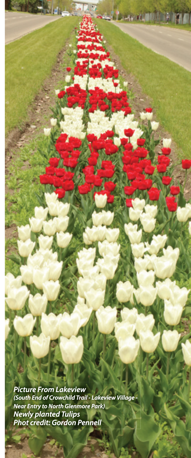
Picture From Lakeview (South End of Crowchild Trail - Lakeview Village - Near Entry to North Glenmore Park) Newly planted Tulips