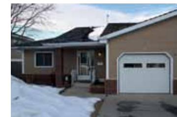
#2, 140 Strathaven Circle SW *COMING SOON!*