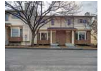
12 Patina Park SW 2 Bed / 1.5 Bath