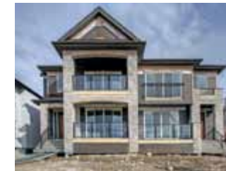
5608 - 37 Street SW 3 Bed / 2.5 Bath