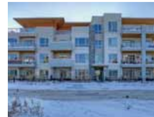
#401, 23 Burma Star Road SW 2 Bed / 2.5 Bath