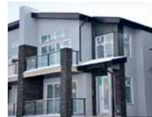
5604 - 37 Street SW 3 Bed / 2.5 Bath