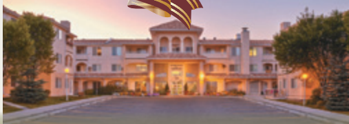
THE MANOR VILLAGE AT SIGNATURE PARK