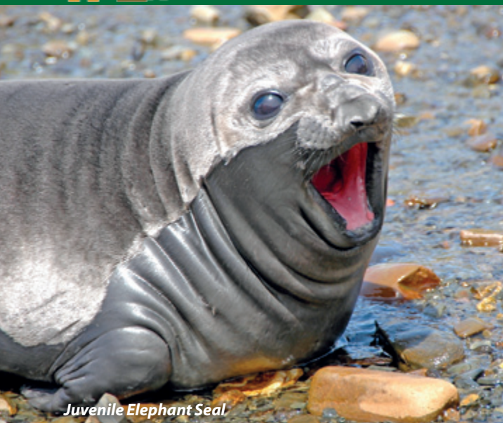
Juvenile Elephant Seal