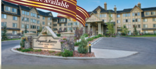
THE STAYWELL MANOR AT GARRISON WOODS