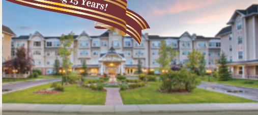
THE MANOR VILLAGE AT GARRISON WOODS