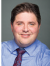
MP Calgary Centre Hon. Kent Hehr 950 6 Ave SW Calgary, Alberta T2P 1E4 ✉ kent.hehr@parl.gc.ca ☎ 403-244-1880 🌐 www.KentHehrMP.ca

I hope everyone is enjoying this gorgeous summer! And, just for fun, we are working on a design for t-shirts to show our pride in our small but mighty community, officially Calgary's littlest neighbourhood! Stay tuned...