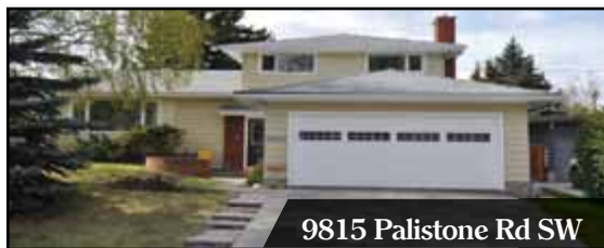
9815 Palistone Rd SW

9815 Palistone Rd SW - Palliser - $599,900 - Great family home with over 2100 sq ft of living space above grade located walking distance from Nellie McClung and Louis Riel Schools. Offering 4 bedrooms above grade, including Master suite with 3pc ensuite, additional 4th bedroom in basement and tons of living spaces throughout to accommodate your growing family. Sunny west backyard with covered patio, storage shed/playroom and more. A short distance from South Glenmore park, Glenmore landing and more. Call for details. MLS#C4069130