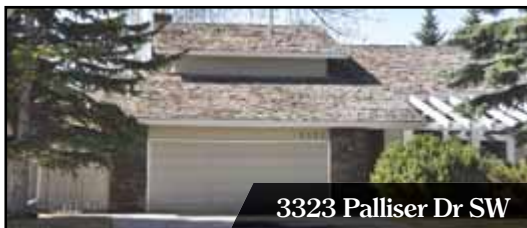
3323 Palliser Dr SW

9815 Palistone Rd SW - Palliser - $599,900 - Great family home with over 2100 sq ft of living space above grade located walking distance from Nellie McClung and Louis Riel Schools. Offering 4 bedrooms above grade, including Master suite with 3pc ensuite, additional 4th bedroom in basement and tons of living spaces throughout to accommodate your growing family. Sunny west backyard with covered patio, storage shed/playroom and more. A short distance from South Glenmore park, Glenmore landing and more. Call for details. MLS#C4069130