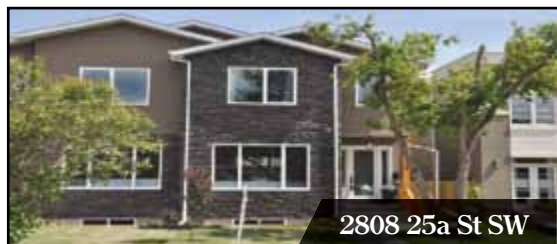
2808 25a St SW

3323 Palliser Dr SW - Oakridge - $659,900 - Great value in Oakridge, this 2088 sq ft 2 storey split home features numerous upgrades including an updated kitchen with professional stainless steel appliances, 3 bedrooms & loft upstairs with updated bathrooms includes 4pc ensuite with steam shower & double vanity. Also featuring vaulted ceilings, hardwood floors throughout & room to grow in basement this home is move in ready! MLS#4044951