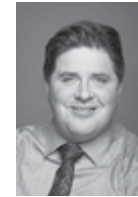
MP CALGARY CENTRE HON. KENT HEHR

Engagement activities are planned for this summer. Visit engage.calgary.ca/planningchinatown to get involved and learn more.