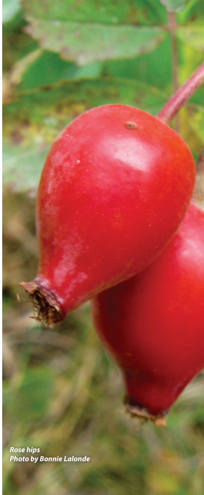
Rose hips