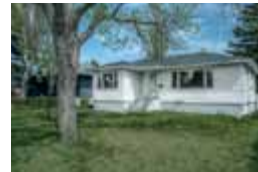
1238 19 Street NW 3 Beds | 2 Baths | $619,900