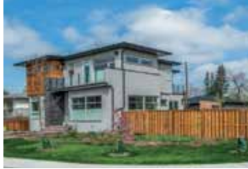
1348 Colgrove Avenue 4 Beds | 3.5 Baths | $1,798,000