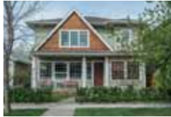
511 7A Street NE Detached | Over 4,000 ft 2 Living Space | $1,144,000