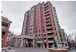
#101, 690 Princeton Way Exquisite Luxury Right On The Bow | $912,000