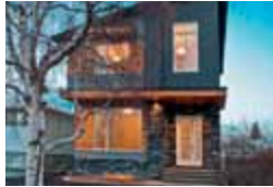
811 20A Avenue NE Detached | Over 3,000 ft 2 Living Space | $1,149,900