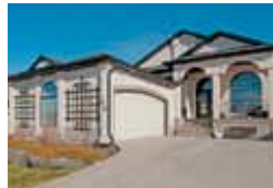
44 Hackamore Trail Live on the Golf Course | $830,500