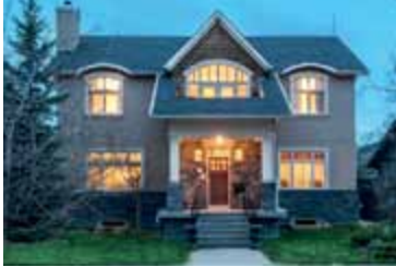
3029 2 Street SW 4 Beds | 2.5 Baths | $1,998,000