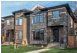
454 29 Avenue NE 4 Beds | 3.5 Baths | $709,900